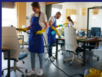
Office & Commercial Cleaners