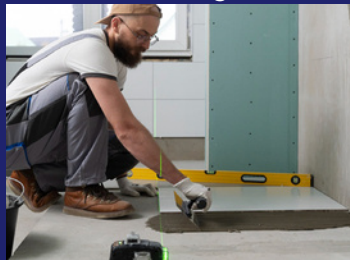
Tile & Flooring Works