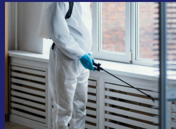
Pest Control Services